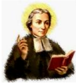
Saint John Baptist de La Salle Patron Saint of Teachers