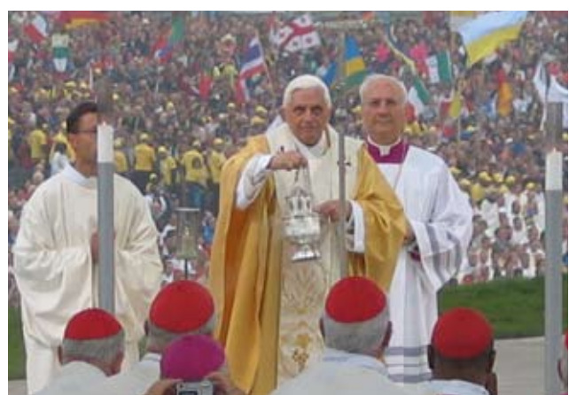
Pope Benedict XVI leads World Youth Day 2005 in Cologne, Germany