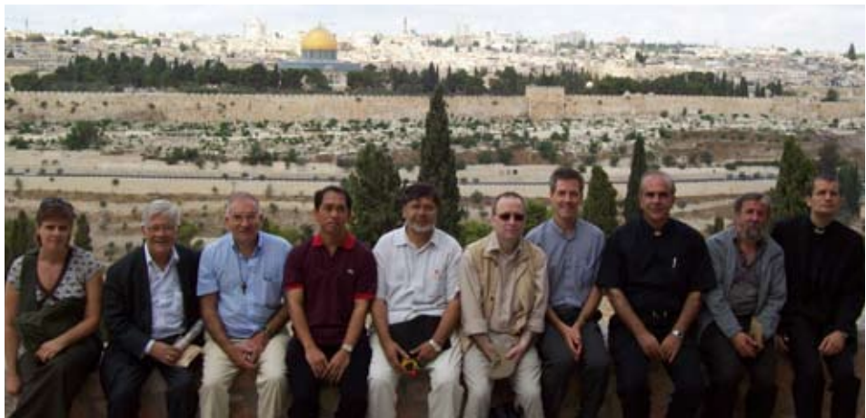
Conference presenters on a trip to Jerusalem

define the next step. “We are planning a second conference for the Fall of 2008, and we hope to have a comprehensive website about interreligious dialogue,”