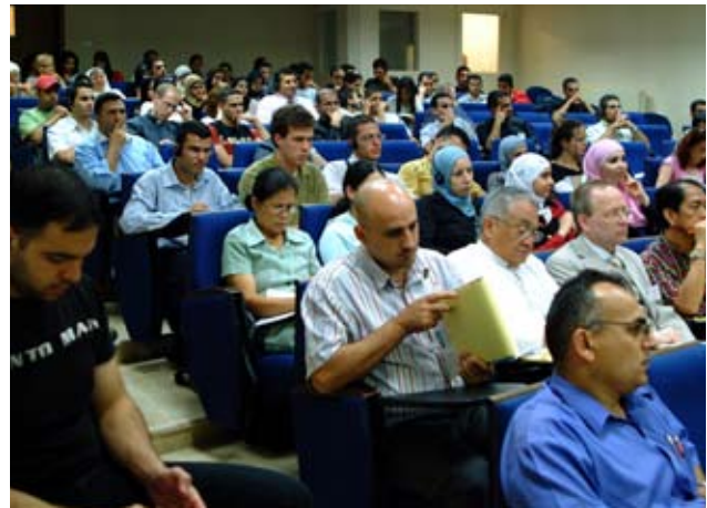
Participants at the International Religious Conference at Bethlehem University