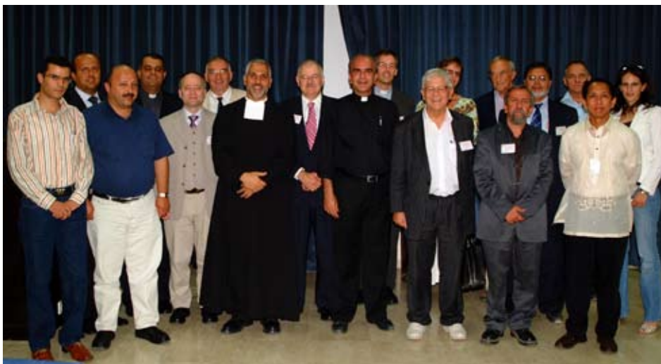
Bethlehem University faculty stand with Conference presenters in Furno Hall